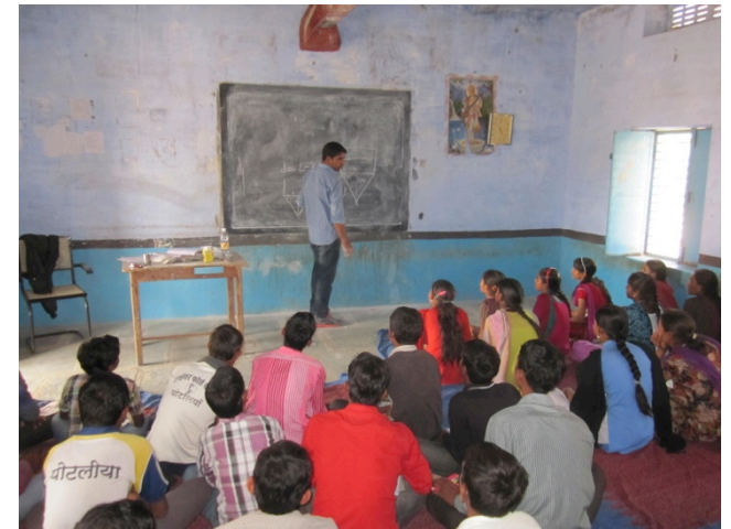
Extra Classes being conducted in selected government schools in rural areas