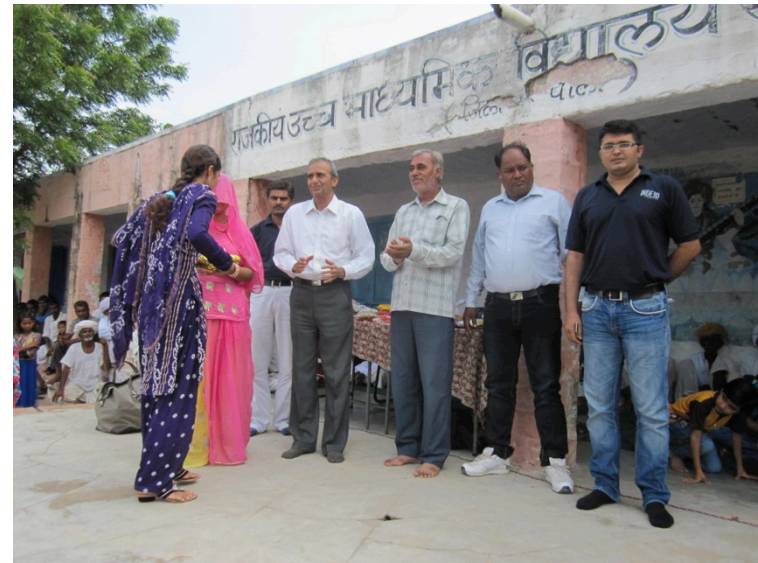
Felicitating student achievers for excellent academic performance in Rajasthan Board exams 2015